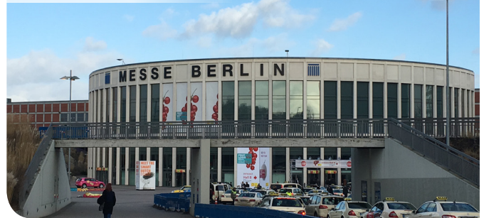
The Fruit Logistica in Berlin.

post-harvest handling and storage were discussed. Topics featuring Honey Crisp, Gala and Fuji emphasised the grower needs to find profitability in growing these modern apple varieties.