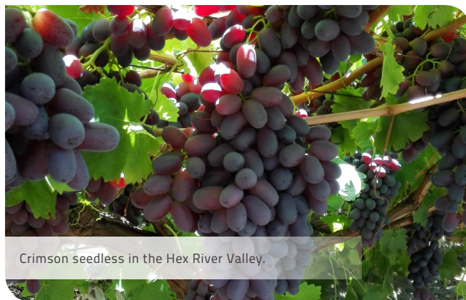
Crimson seedless in the Hex River Valley.

SAPO Trust has performed virus elimination processes on the Crimson seedless variety during the past couple of years. The clean clone was planted and performs very well in terms of colour and production — as can be seen in the photo above taken at the Hex River Valley. This clean clone is available for nurseries to order from SAPO.